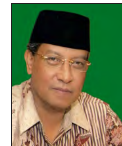
Dr. KH. Said Aqiel Siradj MA Chairman, Nahdlatul Ulama, Republic of Indonesia