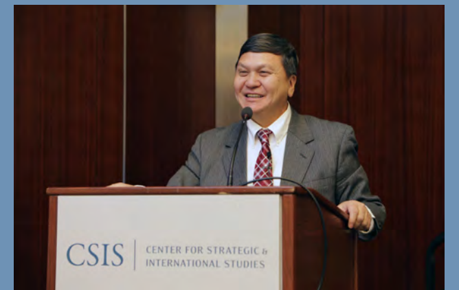
Dr. Tsedendamba Batbayar, Mongolia’s Minister of Foreign Affairs, speaks at the forum.

The forum series is examining multilateral contributions supporting Korean-led unification initiatives predicated on principles and historic values in Korean culture. The forum series builds on a prior GPF Korea Media and Culture Forum Series conducted in Seoul and Tokyo, ongoing work by the Center for Strategic and International Studies on unification, and a Global Peace Leadership Conference in Seoul in collaboration with Korea’s Ministry of Unification and the Korea Institute for National Unification. The first Georgetown University forum examined the role of Mongolia in facilitating Korean unification.