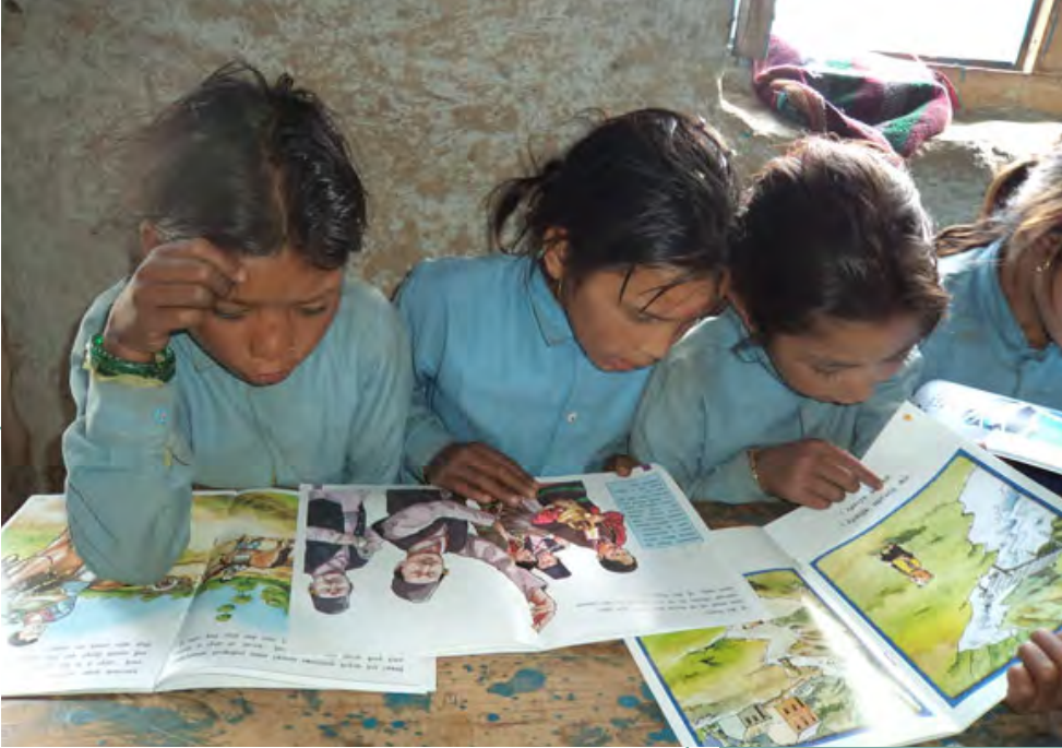
Opposite Above: Children on the grounds of an area revitalized by Global Exchange-Community Change volunteers. Opposite Below: A Nepali woman with a clean cookstove provided by Global Peace Women. Clean cookstoves are more economical to use and greatly reduce dangerous indoor air pollution. Left: Nepalese children at a Global Peace Library. Below: GlobALS instruction in Mindanao in the Philippines.