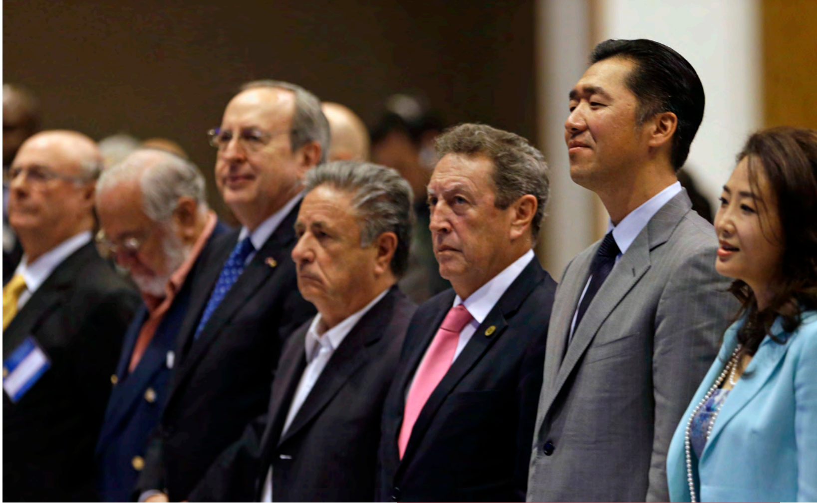
Opposite Above: Former Bolivian President Carlos Mesa speaks at a forum at the 2014 Global Peace Convention in Asunción, Paraguay. Above: GPF Chairman Dr. Hyun Jin P. Moon and Global Peace Women Chairwoman Dr. Jun Suk Moon with former heads of state at the Global Peace Convention in Asunción. Pictured from left: Former Presidents Hipólito Mejía (Dominican Republic), Gustavo Noboa (Ecuador), Rafael Calderón (Costa Rica), Eduardo Duhalde (Argentina) and Vinicio Cerezo (Guatemala).

The Esquipulas Foundation for Central American Integration, in partnership with the Latin American Presidential Mission and the Global Peace Foundation, hosted a regional forum, “Towards a New Model of Economic and Social Development for the Region,” in August 2014. The forum sought to contribute to the renewal of Central America by developing strategies to modernize and streamline regional integration and development. Participants included 10 former presidents of Latin America and more than 100 Central American civil society leaders.