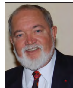
Sir James R. Mancham KBE Founding President, Republic of Seychelles