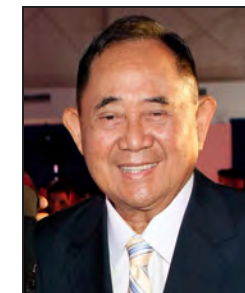
Hon. Jose de Venecia, Jr. Former Speaker, House of Representatives, Republic of Philippines