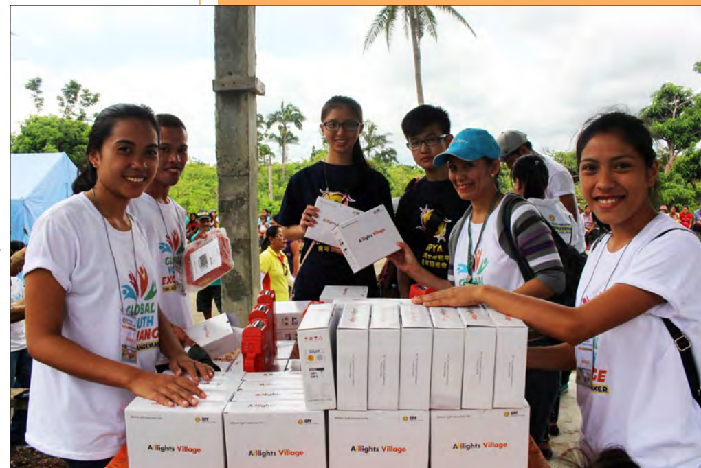
International volunteers provide relief supplies in the Philippines in the aftermath of Typhoon Yolanda.

The Global Peace Youth Exchange is a service learning program connecting international volunteers with local volunteers in sustainable, community-based development initiatives. The program is building lasting relationships between youth of different nations, and a common commitment to service and global leadership.