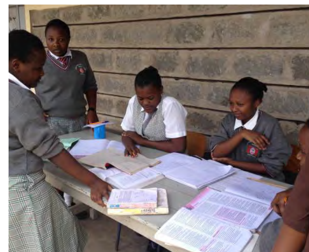
Above: Students collaborating at a Leap Hub in Nairobi. Right: CCI teacher training sessions in Indonesia.

Leap Hubs provide the guidance and space in secondary schools for highly motivated students to explore their ideas and learn what it takes to become social entrepreneurs. Separate from regular school curricula, small groups of exceptional youth build leadership and entrepreneurship competencies through a student-driven education model. Teachers guide students through the phases of developing a new business or enterprise and mentors and online resources supplement the students’ development as they gain confidence and entrepreneurial skills. Leap Hubs has concluded a testing phase and is now entering the pilot year in Kenya.