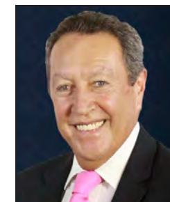
H.E. Marco Vinicio Cerezo Former President, Guatemala; President, Esquipulas Foundation